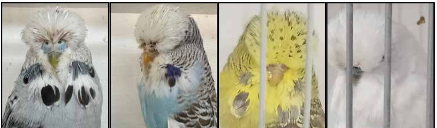
Gearing Lot 92 Gearing Lot 93 Matthews Lot 94 Matthews Lot 95