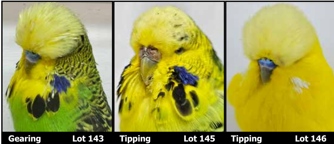
Gearing Lot 143 Tipping Lot 145 Tipping Lot 146