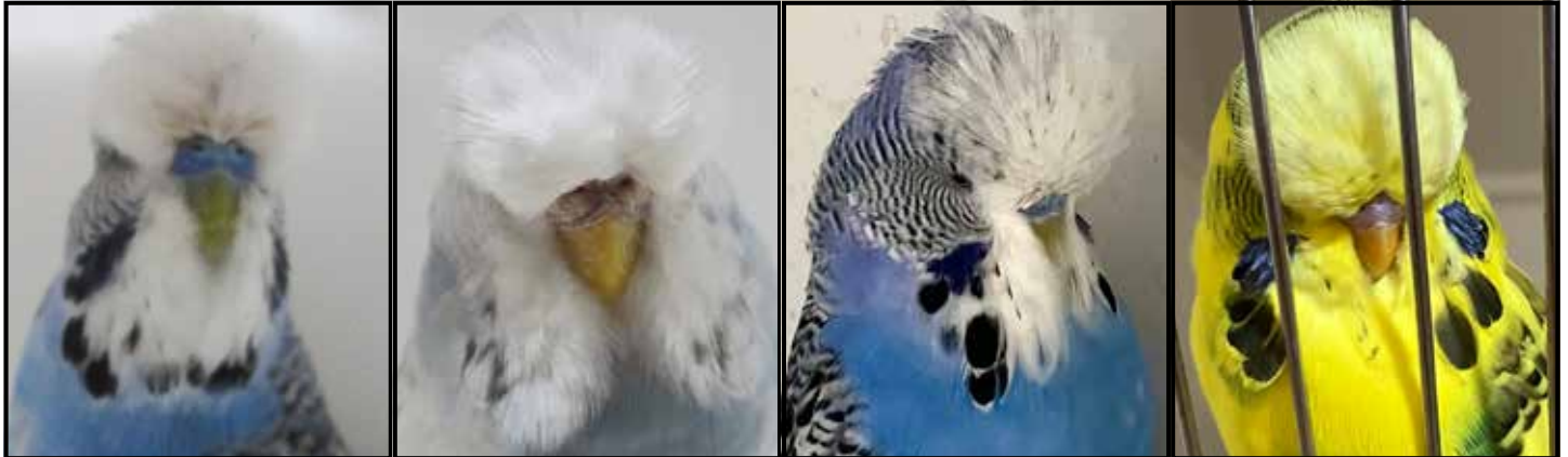
O'Callaghan Lot 48 O'Callaghan Lot 49 Capasso Lot 50 Capasso Lot 51