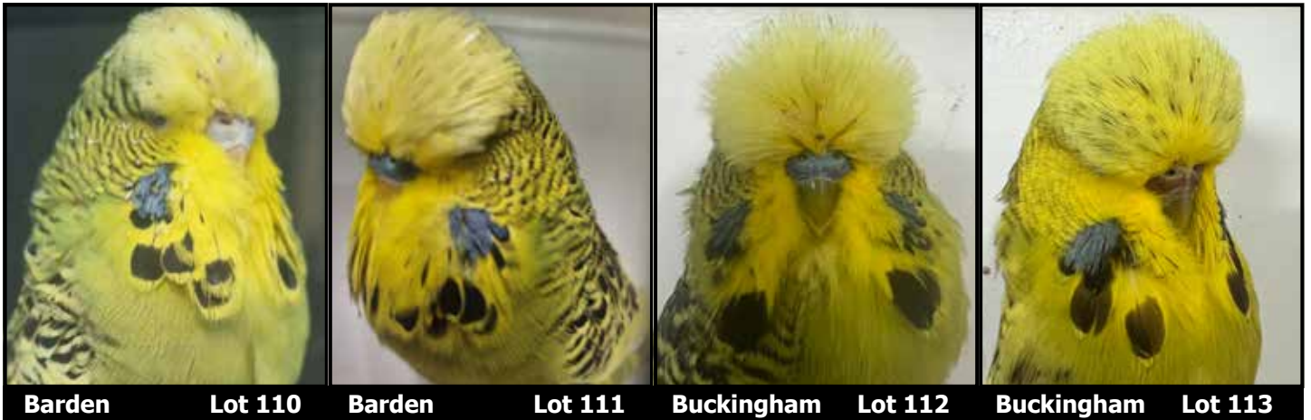
Barden Lot 110 Barden Lot 111 Buckingham Lot 112 Buckingham Lot 113