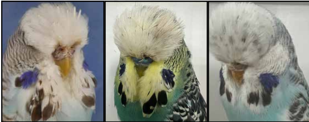
Boss Lot 119 Buckingham Lot 122 Buckingham Lot 123