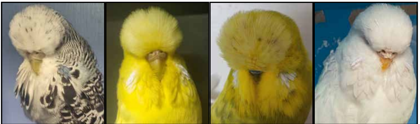
Barden Lot 147 Barden Lot 148 G & H Hibberd Lot 149 Ennis Lot 153