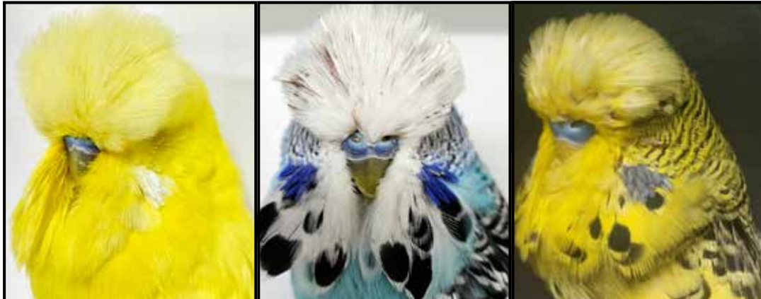
Tipping Lot 56 Tipping Lot 57 Barden Lot 58