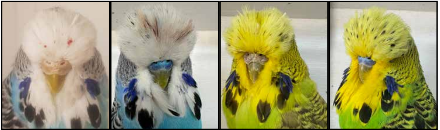
Wheatley Lot 39 Gearing Lot 40 Gearing Lot 41 Gearing Lot 42