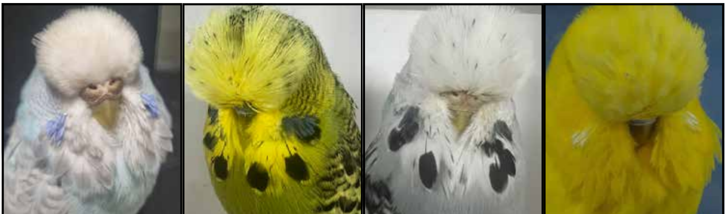
Barden Lot 59 Buckingham Lot 61 Buckingham Lot 62 Boss Lot 63