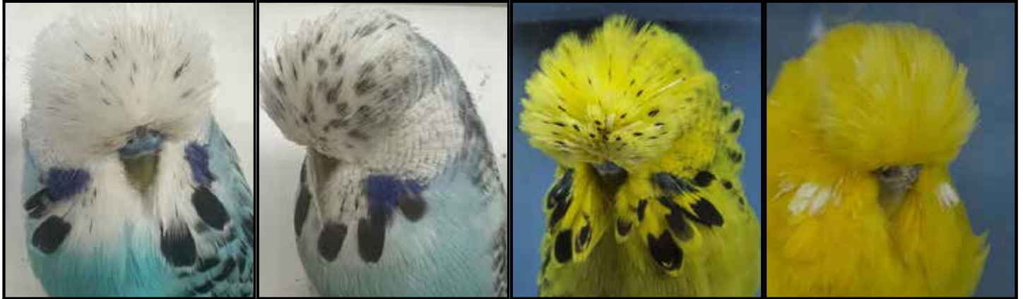
Buckingham Lot 31 Buckingham Lot 32 Boss Lot 33 Boss Lot 34