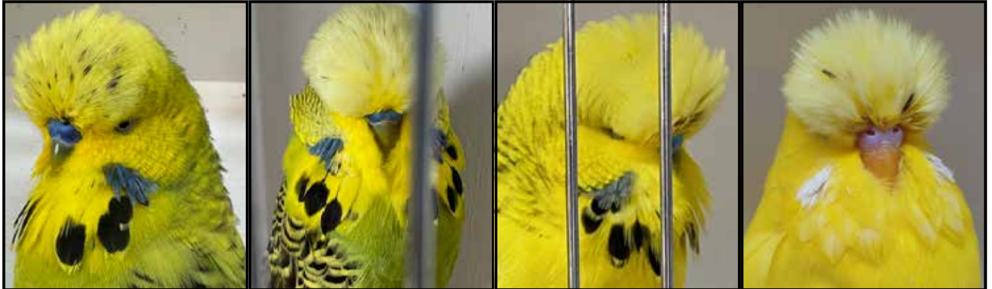
Gearing Lot 72 Ennis Lot 73 Ennis Lot 74 Leong Lot 75