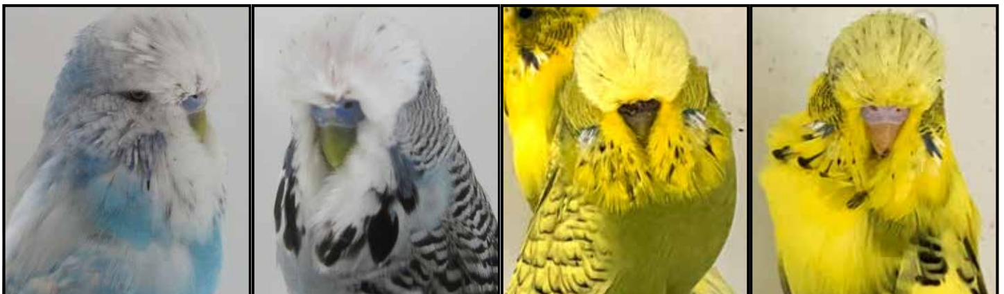
O'Callaghan Lot 132 O'Callaghan Lot 133 Capasso Lot 134 Capasso Lot 135