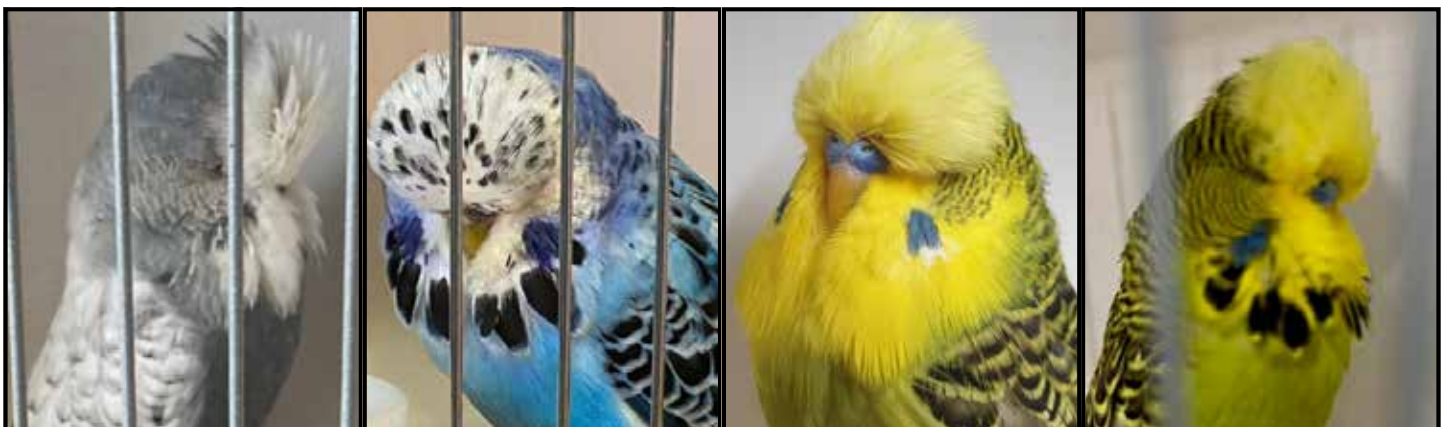
Ennis Lot 43 Ennis Lot 44 Leong Lot 45 Barnett Lot 47