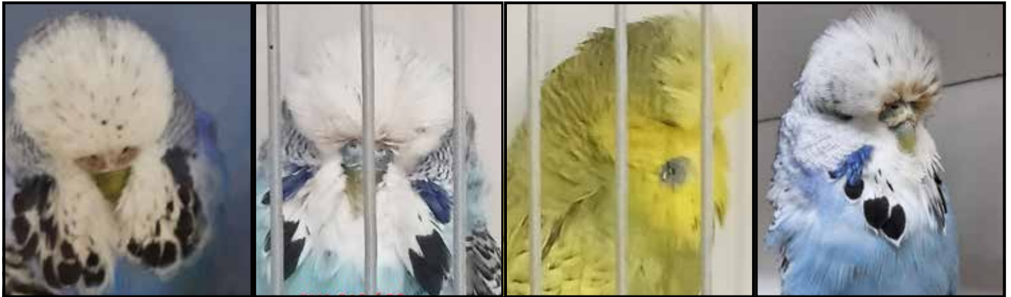
Boss Lot 64 Hewitt Lot 65 Matthews Lot 66 Boal Lot 67