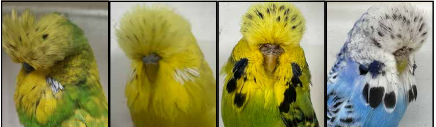
Barden Lot 87 Buckingham Lot 89 Buckingham Lot 90 Gearing Lot 91