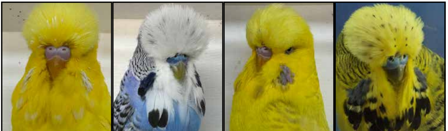
Gearing Lot 115 Gearing Lot 116 Gearing Lot 117 Boss Lot 118