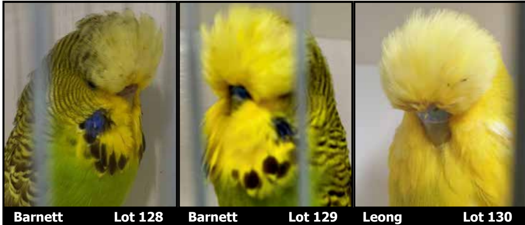
Barnett Lot 128 Barnett Lot 129 Leong Lot 130