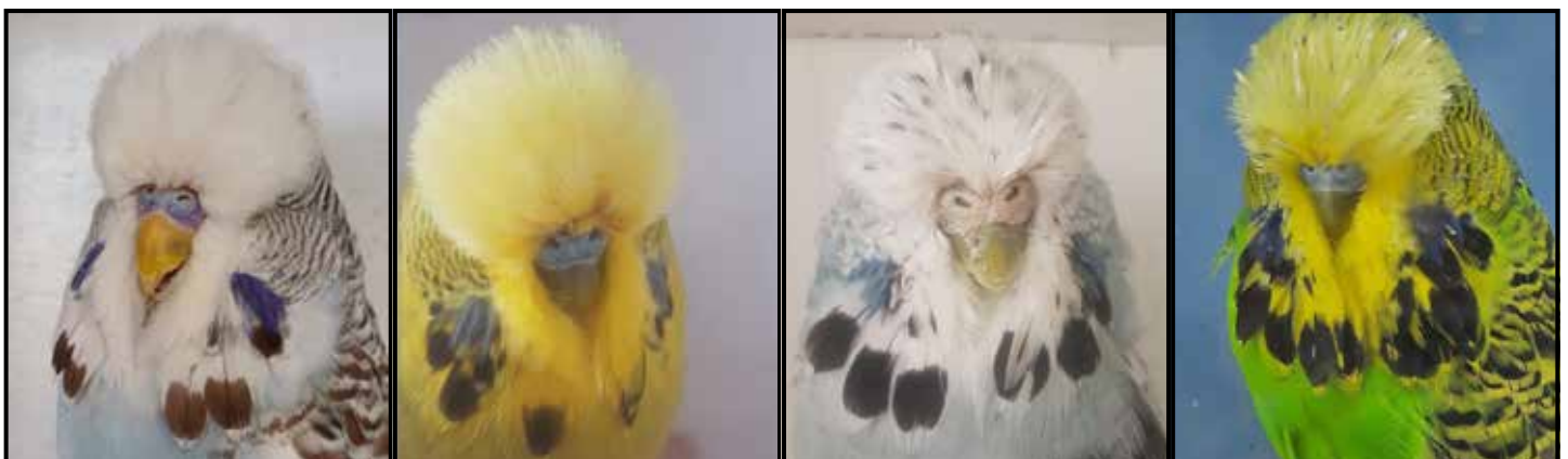
G & H Hibberd Lot 5 Wheatley Lot 6 Wheatley Lot 7 Boss Lot 8