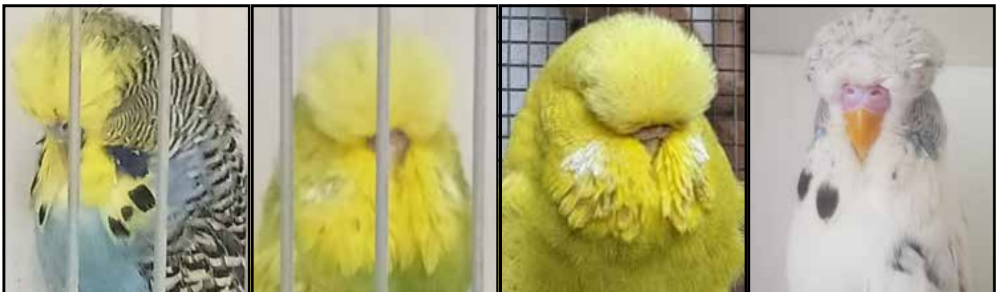
Hewitt Lot 35 Matthews Lot 36 Boal Lot 37 Wheatley Lot 38