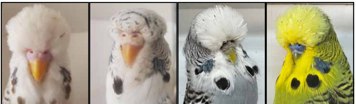
Wheatley Lot 68 Wheatley Lot 69 Gearing Lot 70 Gearing Lot 71