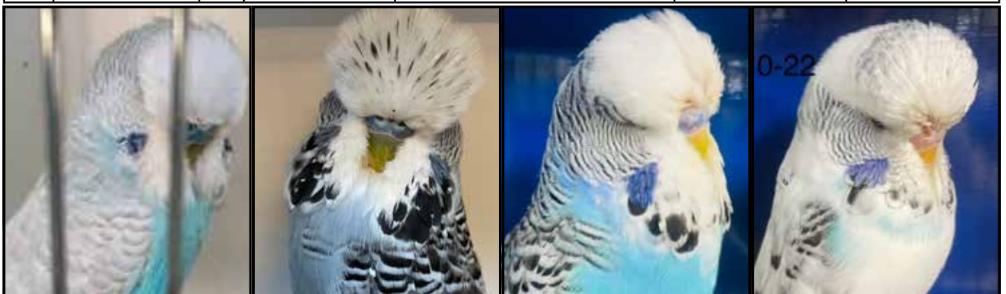
I & K Manton Lot 52 Weidenhofer Lot 53 Butt Lot 54 Butt Lot 55