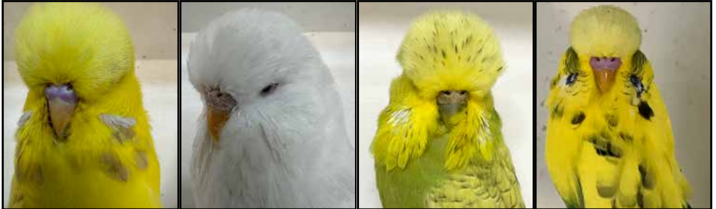
Gearing Lot 1 Gearing Lot 2 Capasso Lot 3 Capasso Lot 4