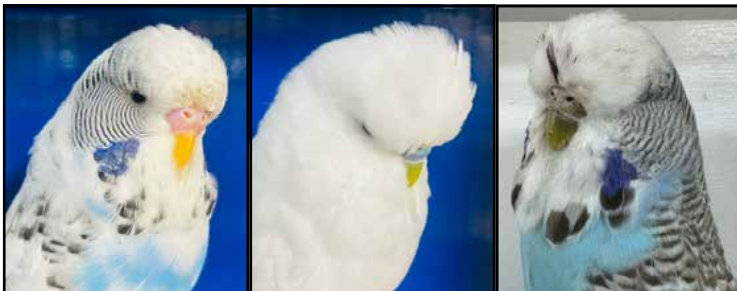
Butt Lot 140 Butt Lot 141 Gearing Lot 142