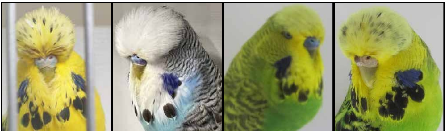
Leong Lot 76 Holmes Lot 77 O'Callghan Lot 78 O'Callghan Lot 79