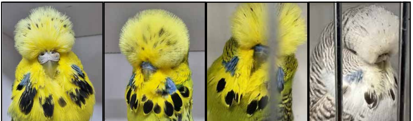
Boal Lot 124 Boal Lot 125 Holmes Lot 126 Holmes Lot 127